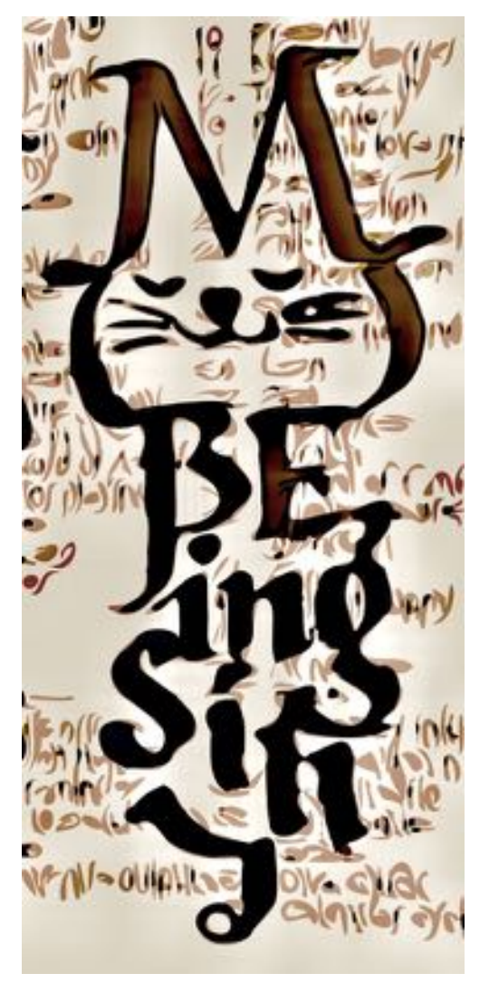
Goly Ostovar : "Me Being Silly"