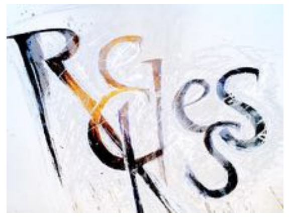
Reckless1- Gold leaf against gray skies