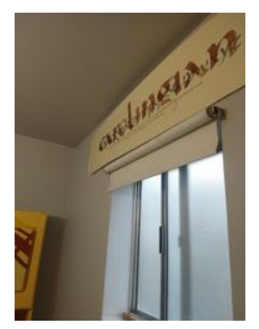
This is to show that creativity has it's drawbacks.