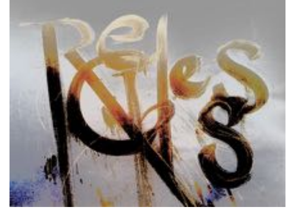
Reckless2- Toffee Macchiato