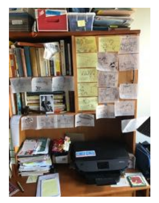
Here are initial draft drawings of what will eventually be a book of cow, ok, ok, Holstein cow cartoons and then cow greeting cards.

I'm thinking that a caption for this if it turns into a card could be "I'm a little stretched. I'll get back to you soon."