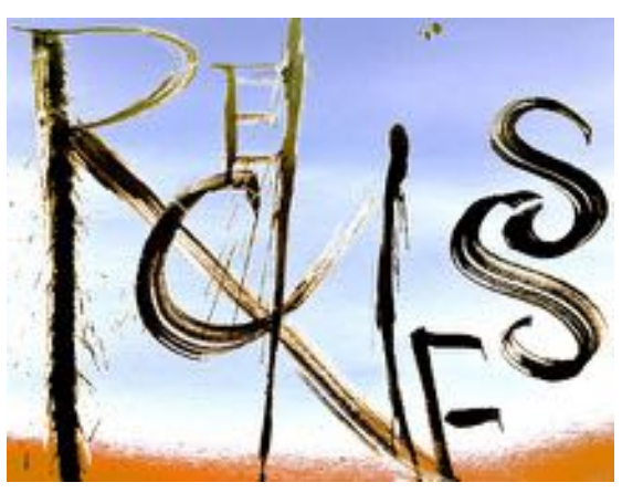
Reckless 3- Industrial wreckage